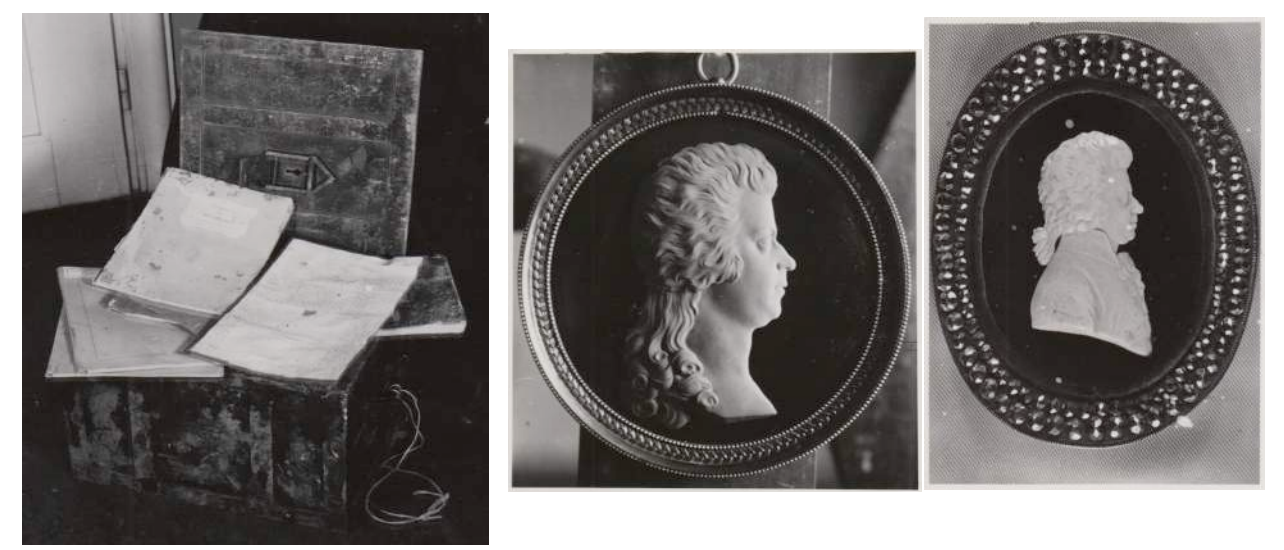
Left: Iron Box containing the most valuable objects from the Mozart Museum, discovered after the war with the lock broken and many objects missing. Center and Right: Two Still Missing Mozart Portraits stolen during, or immediately after World War II - Center: Leonard Posch, Wax relief, 1788; Right: After Leonard Posch, Meerschaum relief, c. 1790. Photo Credit: Internationale Stiftung Mozarteum Salzburg<sup>147</sup>

Item numbers 7-14 above were later found in the Salzburg Museum, having been stored together with that museum's holdings in the salt mine. The "twelve figurines, colored etchings of the first performance of the 'Magic Flute' at Leipzig, 1793" were also found, and Mozart's watch was returned in 1964, but was stolen from the museum in 1966. However, item numbers 1-6, and number 15, above remain missing today.<sup>148</sup>